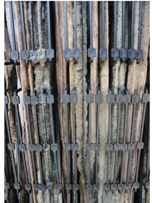
Suspended biomass vertically supported and surrounded by oxygen – a key feature of the BioGill technology.

This makes BioGill bioreactors ideal for the treatment of wastewaters from commercial kitchens and grease traps.